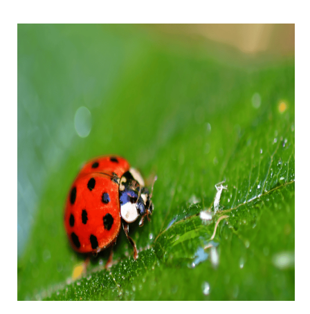
Watch It Grow - Part One